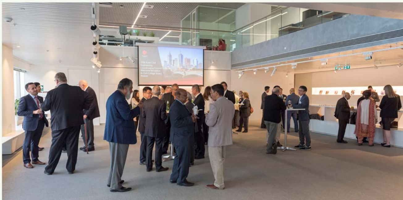
Photo 4. Welcome Cocktail Reception