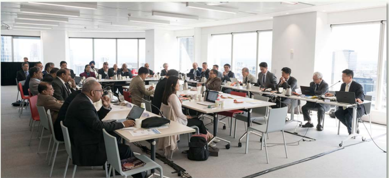
Photo 3. 35 th Executive Committee Meeting at the meeting room of Engineers Australia