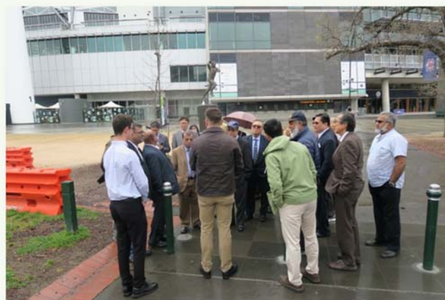
Photo 5. Yarra Park Water Recycling Facility Technical Tour