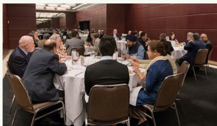
Photo 6. Farewell Dinner at RACV City Club